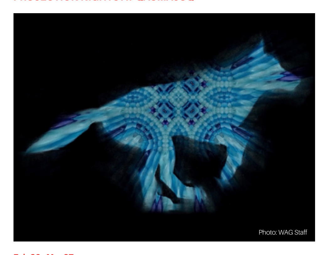
Feb 26 - Mar 27 Friday & Saturday 6:00pm - 10:00pm

Be transported to the North with outdoor projections of contemporary Inuit artwork, imagery, and music celebrating Qaumajuq365, the Inuit art centre's inaugural year!